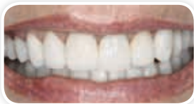
Results may vary.